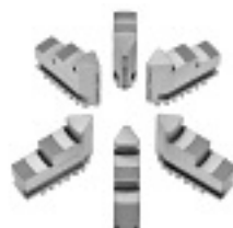
I.D. Hard Solid Jaws