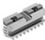
Hard Master Jaws