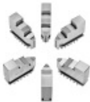
O.D. Hard Solid Jaws