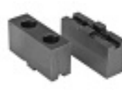
Soft Top Jaws