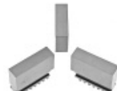
Soft Solid Jaws