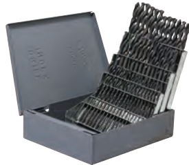
Number Sizes 1 through 60 Folding Metal Case Included 60 Piece Set