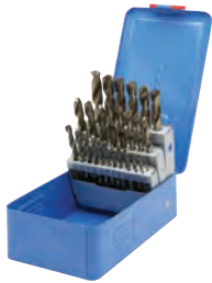
1/16 to 1/2 by 64th Folding Metal Case Included 29 Piece Set