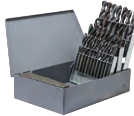
A to Z Inclusive Folding Metal Case Included 26 Piece Set