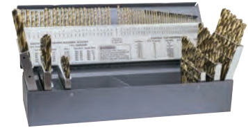
1/16 to 1/2 by 64th Inclusive 1 to 60 Inclusive A to Z Inclusive 115 Piece Set