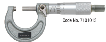
Code No. 7101013