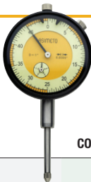
Code No. 7402261