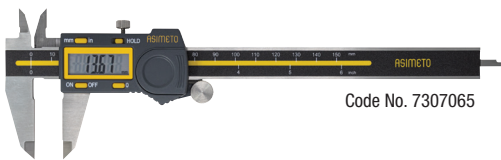
Code No. 7307065