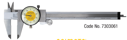
Code No. 7303061